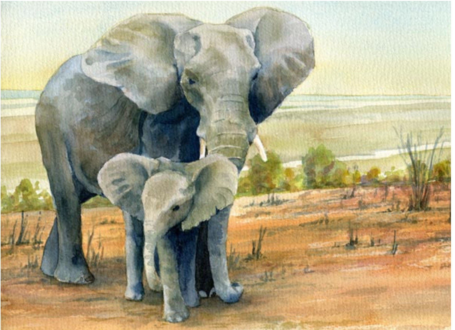
An elephant cow and calf above the Chobe River in Botswana

Earliest humans walked across the African savanna where safaris now search for nature in the raw. One artist worked to capture its sumptuous beauty in real time.