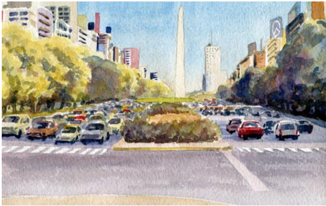
The Obelisk in the center of Buenos Aires' grand Avenida 9 de Julio locates the city's beginning.