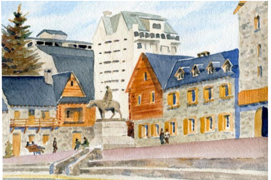
In Puerto Monte, Chile (below) a former farm has become a German Museum noting the tidy influence of immigrants from that country.