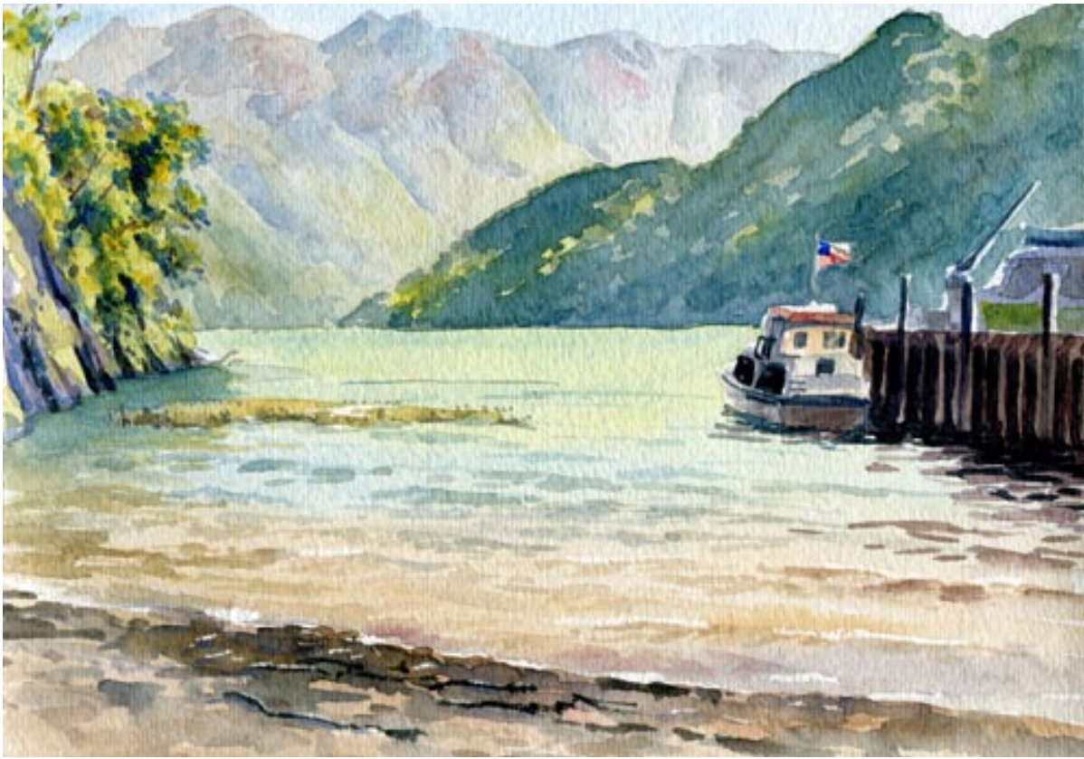
Turquoise water and soaring peaks stretch beyond a boat landing at Peulla, Chile on the shore of Lago Todos los Santos (above).