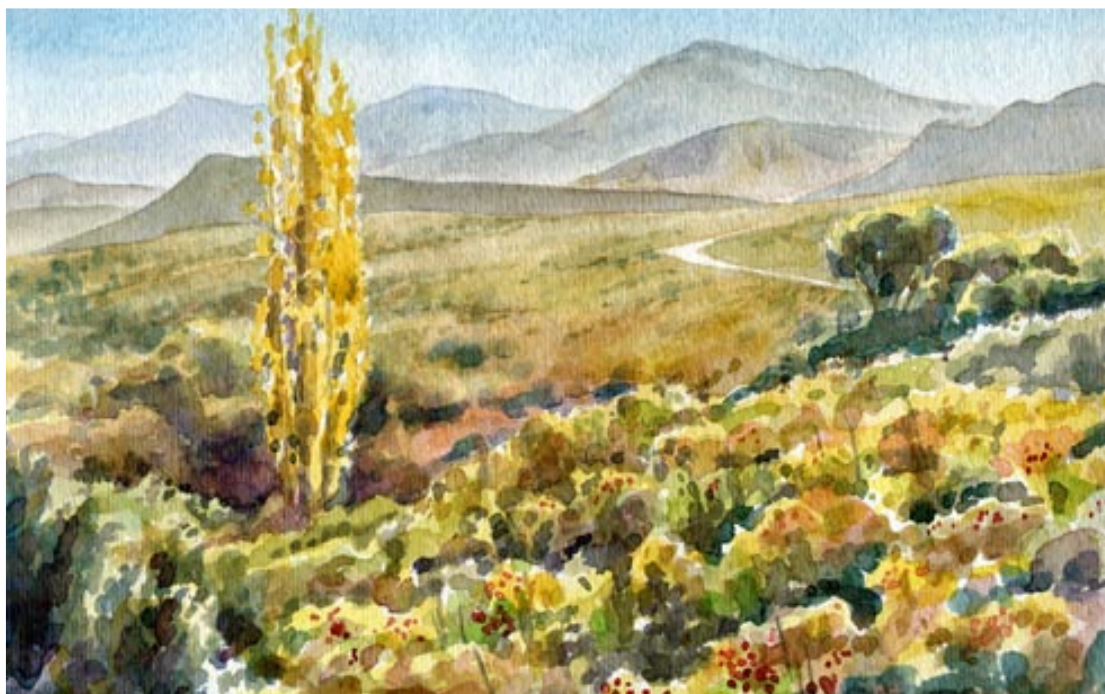
Poplars stand in their autumn glory at the edge of the wildly beautiful Patagonian steppe.

Traveling through southern South America covers more than a change in elevation. From the bustling centers of Santiago and Buenos Aires, to the wind swept Patagonian landscape, the land is suffused with nature, culture, history and the people who shaped it.