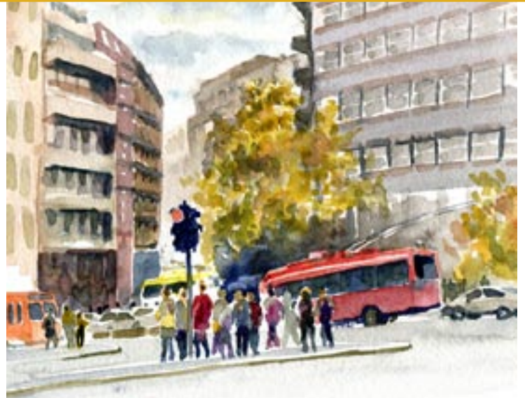
Belgrade, Serbia has colorful buses, but a legacy of ethnic tension and Soviet oppression stains their spirit.