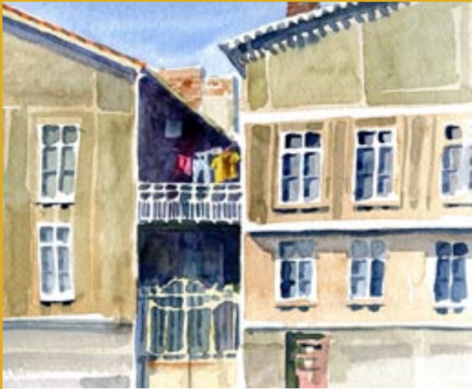
Varna, Bulgaria , a tired Soviet era resort city, squats at the shore of the Black Sea (which isn't black).