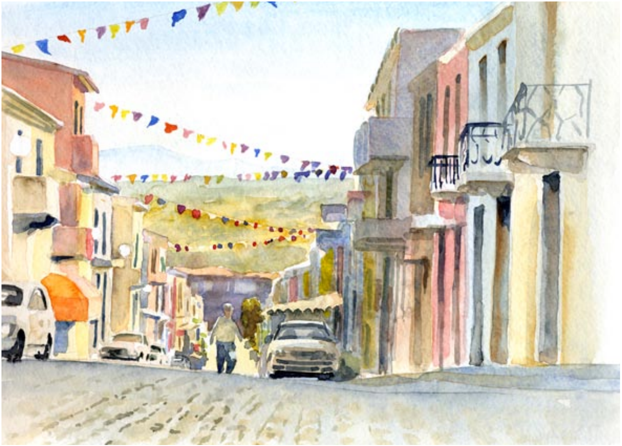
Above: Santa Teresa, Sardinia on it's feastday