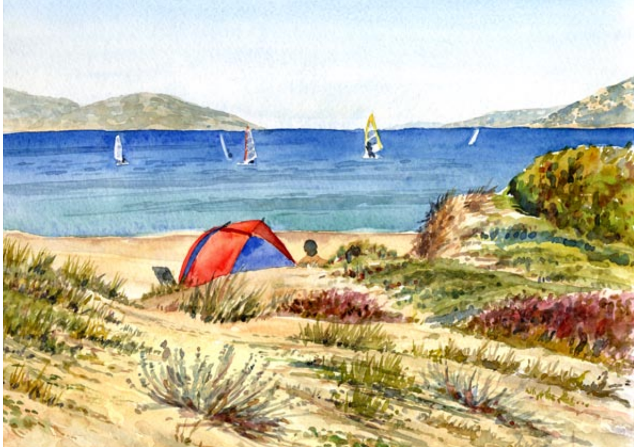
Below: world class wind surfing in Sardinia