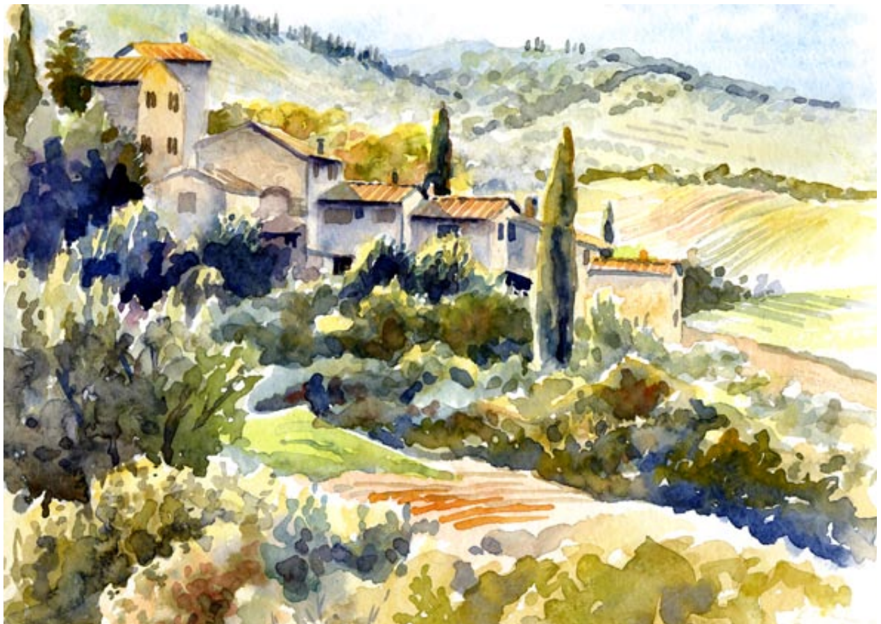
Below: Montefiorelli, south of Florence