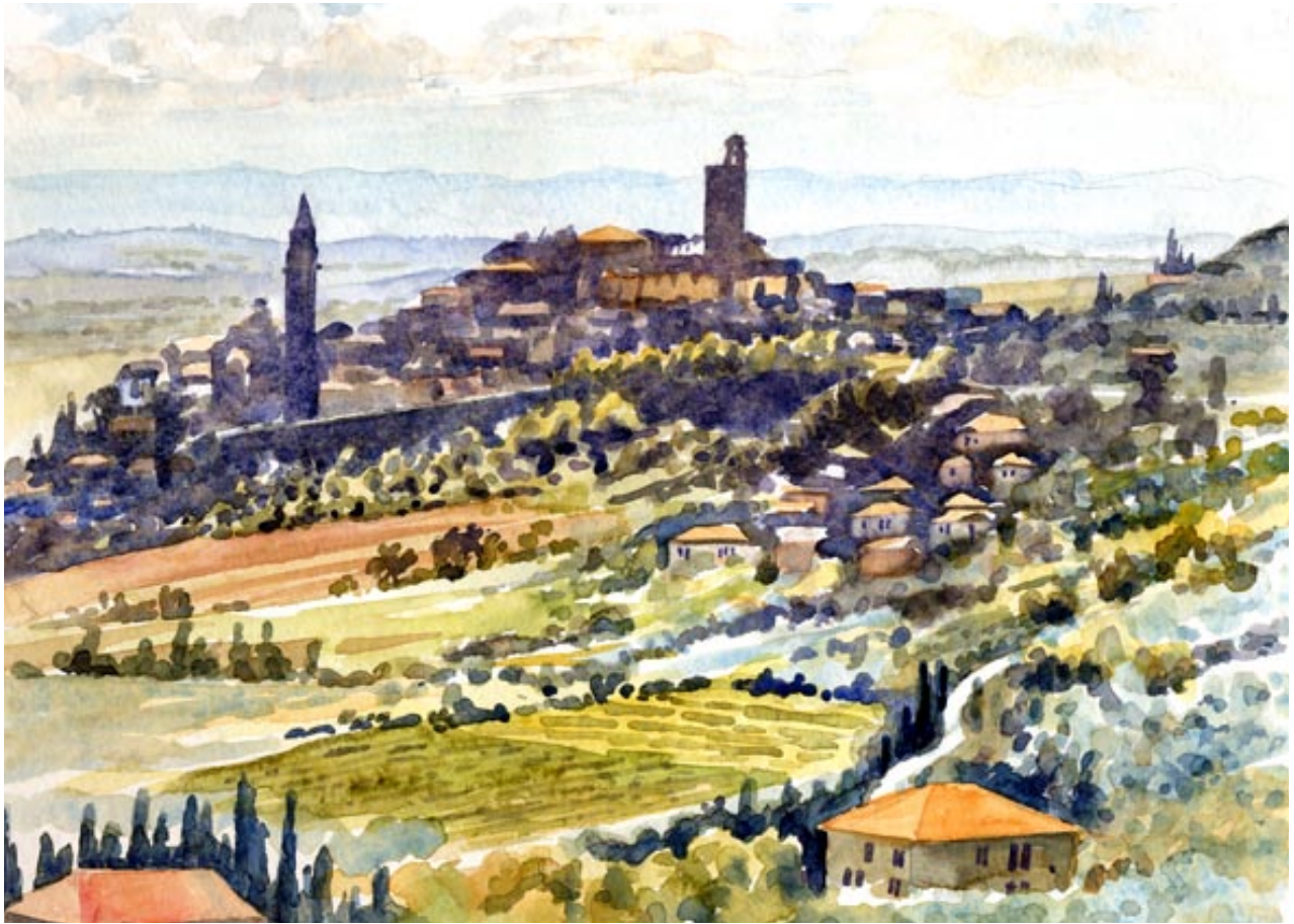
Above: the walled town of Fiorintino, Tuscany