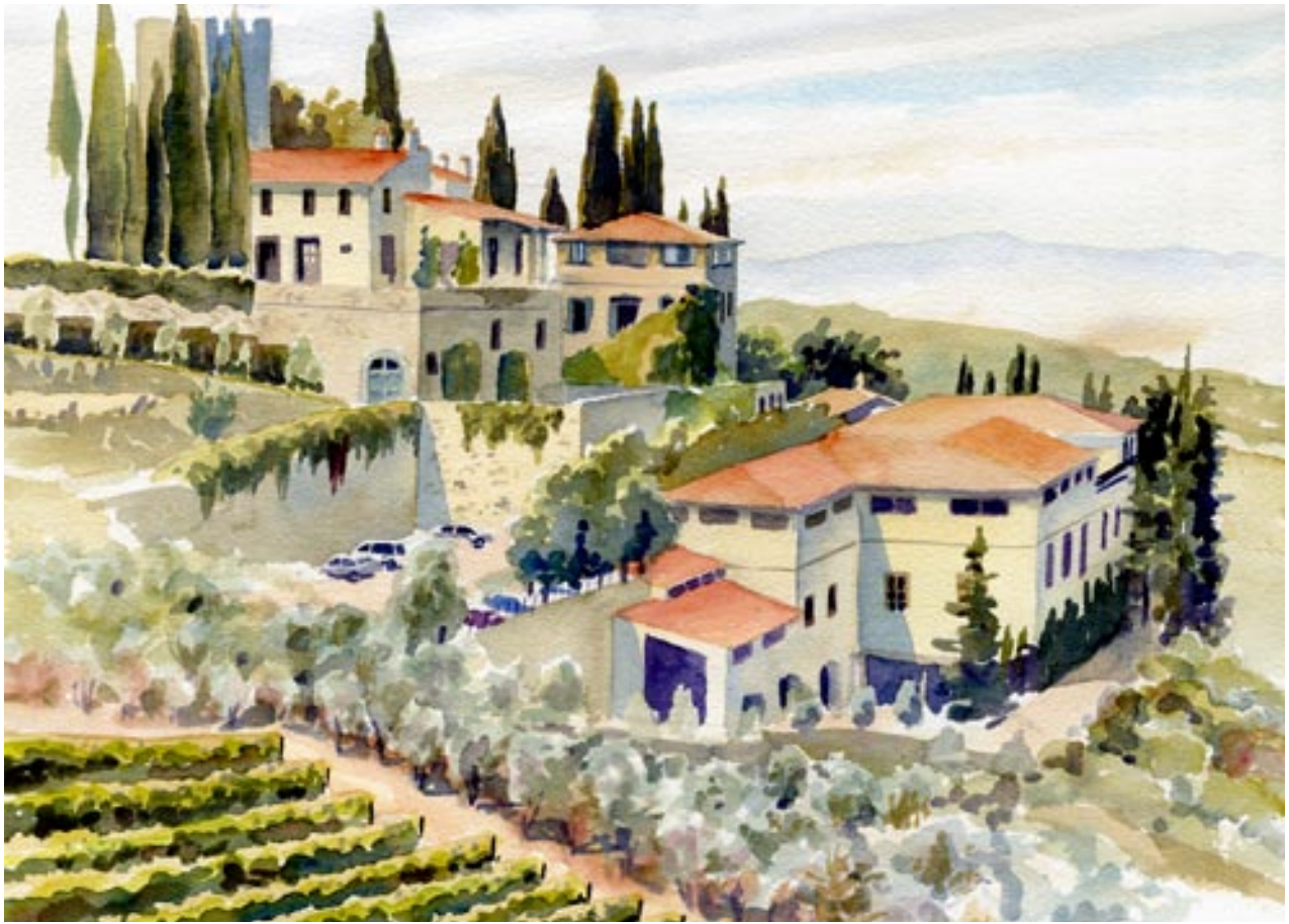
Above: the Verizanno estate in Tuscany