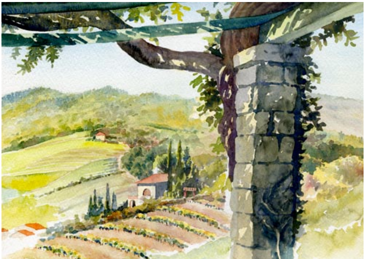
Below: view from Le Piale, Greti in Chianti, Tuscany