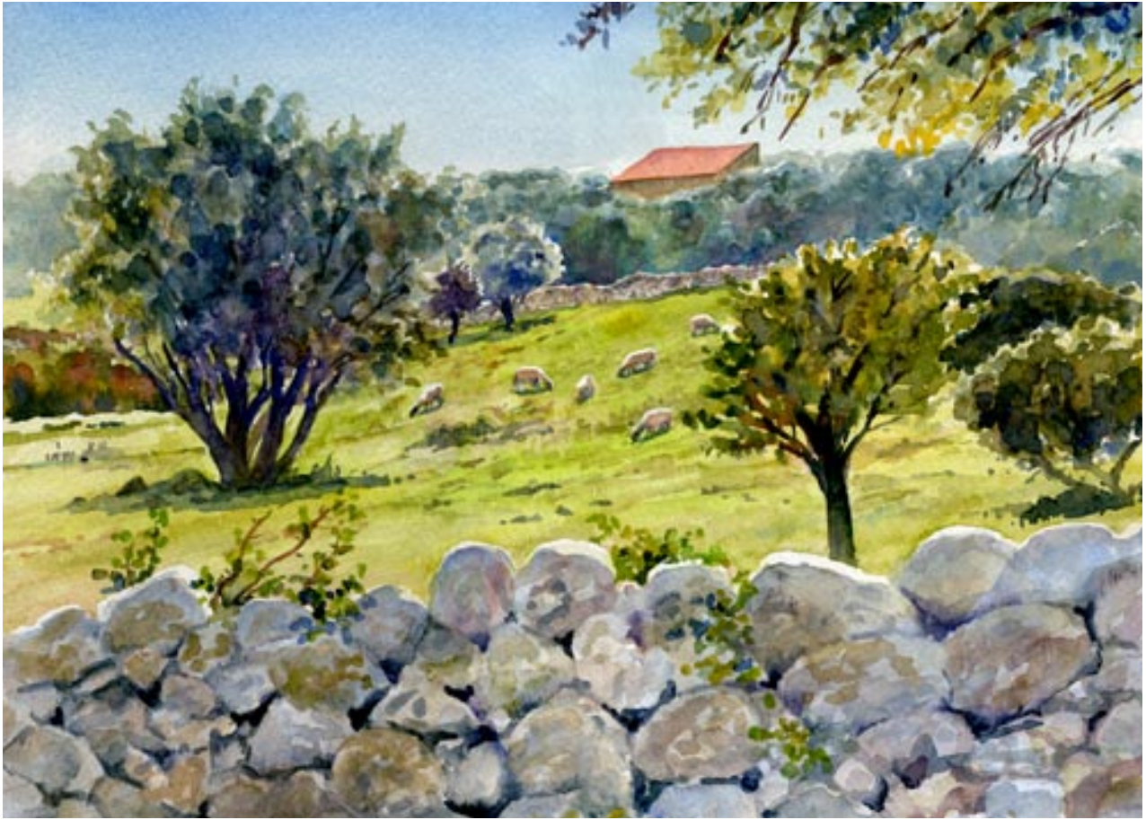
Above: sheep pasture near Porto Pollo, Sardinia