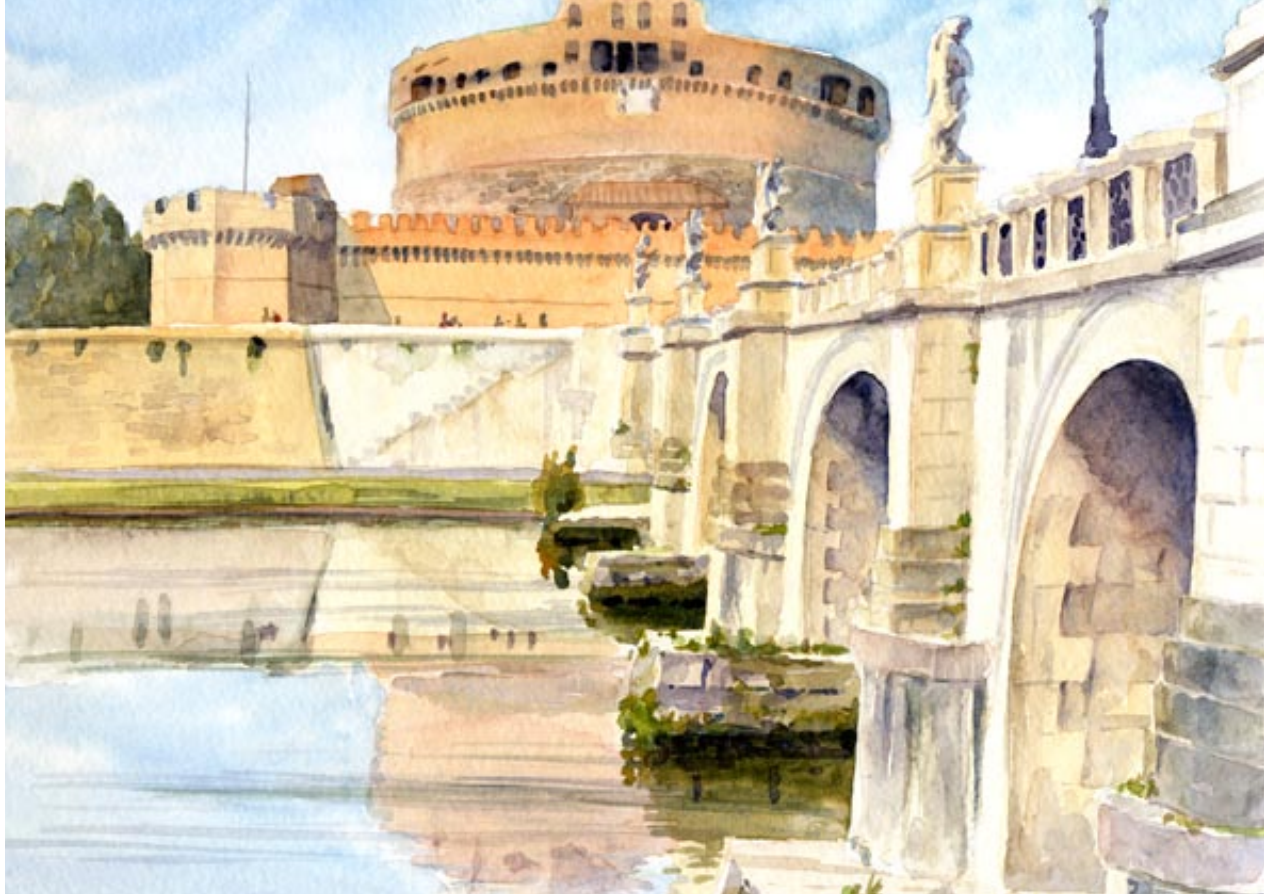
Below: Castel San Angelo, Rome