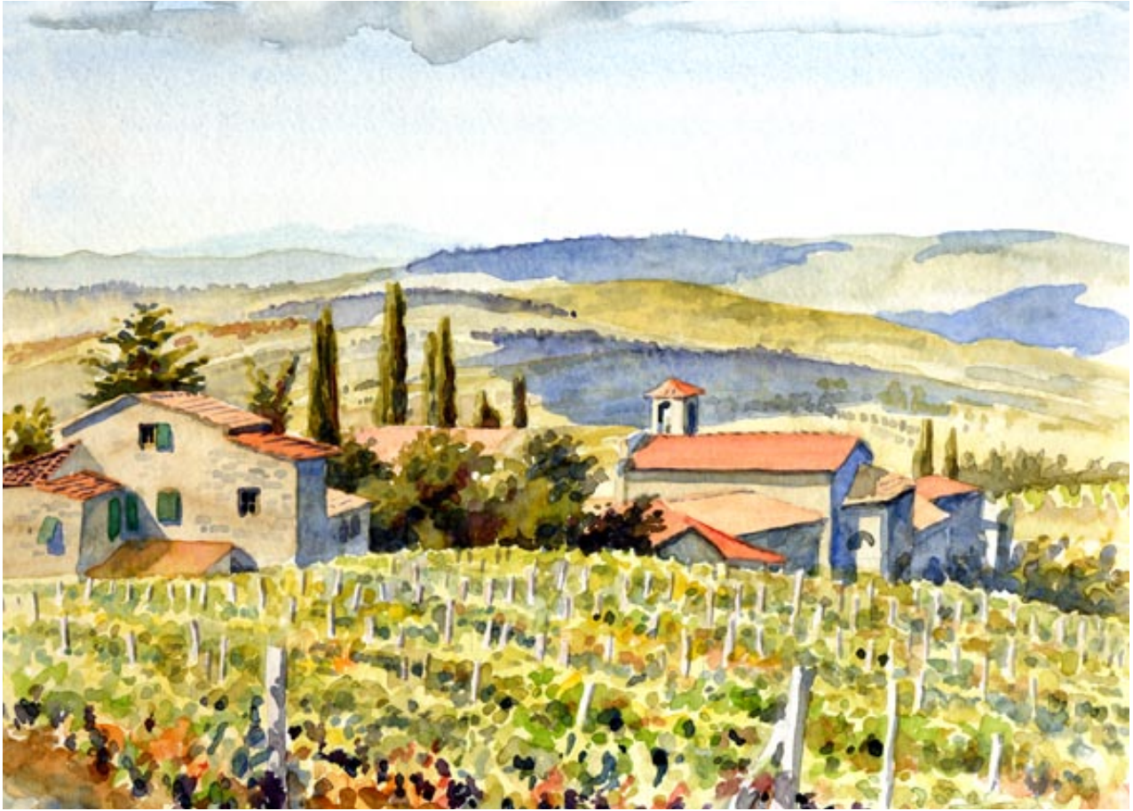
Above: vineyards above Lamole, Tuscany