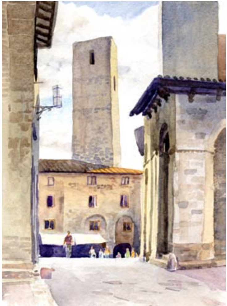
Right: medieval towers in San Gimignano, Tuscany