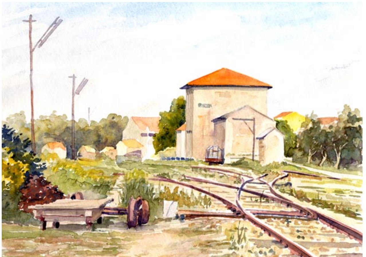
Below: end of the rail line at Palau, Sardinia