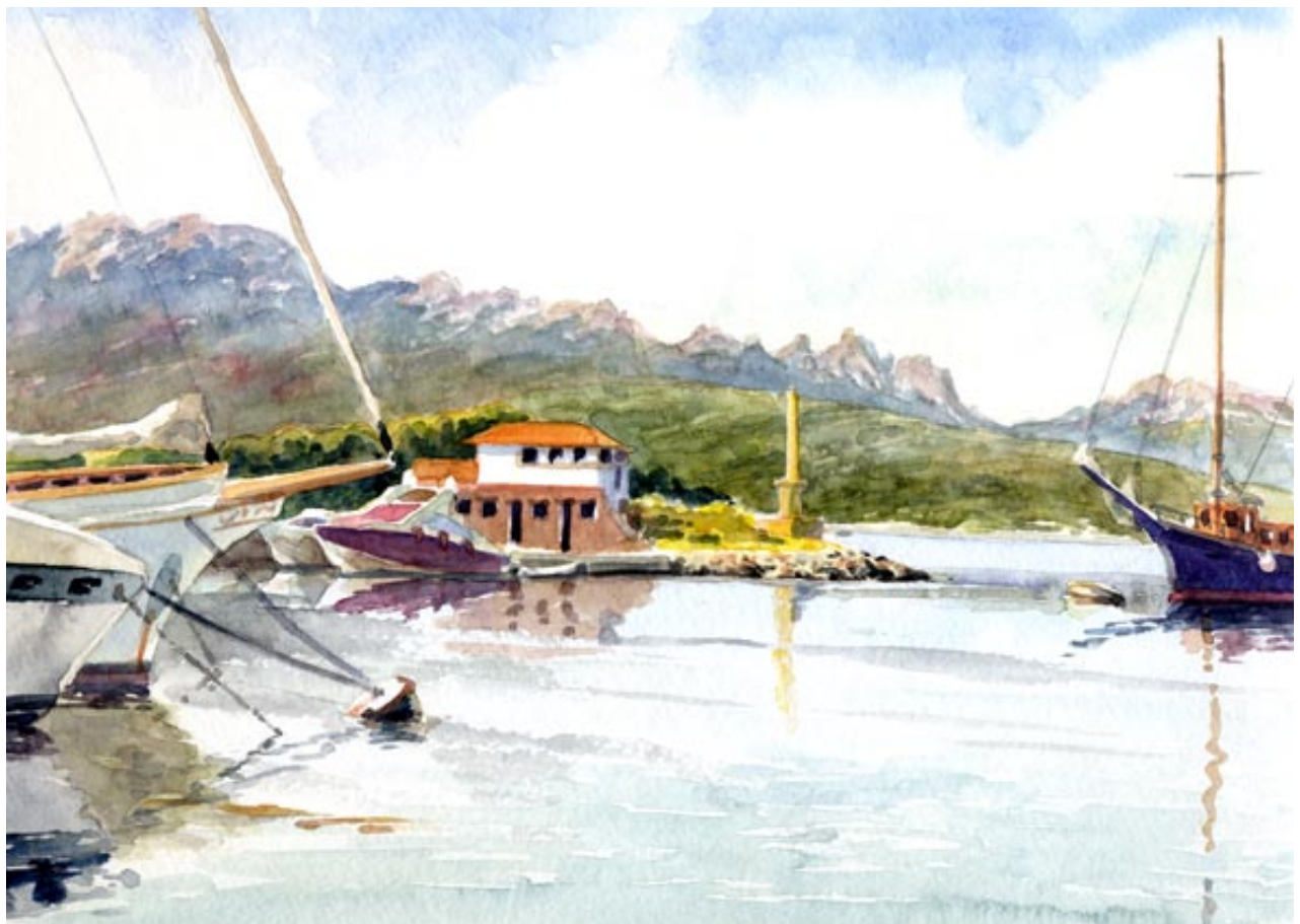
Below: the harbor in Puerto Rotundo, Sardinia