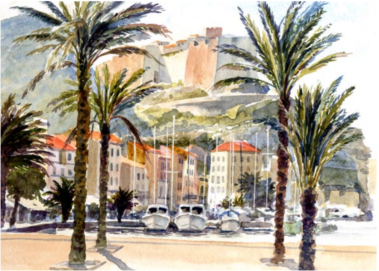
Above: the harbor in Bonifaccio, Corsica